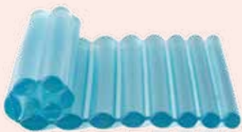
ROLL-UP GEL PILLOW 16" X 10.5" AQUA BLUE 01-88-0020