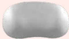
SOFT NECK PILLOW 11" X 15" WHITE 01-88-0010