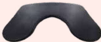
CONTOURED GEL SEAT CUSHION 13" X 7" BLACK GSC-B1

NOT SURE WHAT SOME OF THOSE FEATURES ARE? WE CAN HELP!