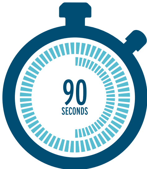
JETTA'S ACTIVE DRAIN TECHNOLOGY

Creating a comfortable bathing experience is our biggest motivator at Jetta – and to us, that extends to making sure you're comfortable while the tub is draining as well. While many walk-in tubs take up to three minutes to fully drain so you can exit the tub, Jetta's unique active drain technology removes water in about 90 seconds.